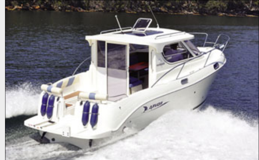
A couple of interesting shots (Above) The transom 'pocket' shape (lowers the draft, gives better water flow for the prop, straighter tracking) and (Below) at rest with a couple of blokes forward. Off plane vision is excellent.

I'm sure there are also going to be issues of ventilation that could require a bit of sideways thinking further down the track,